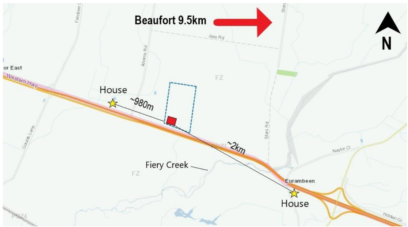
Figure 1: The proposed site is located in the vicinity of two (2) existing dwellings (.98km west and 2km east).

The proposed development is located approximately 950m from the Fiery Creek which is considered to contain some of the best examples of remnant vegetation and physical habitat in the Upper Hopkins Basin. The site is relatively flat and supports views to the nearby Mount Cole State Forest and the Mount Buangor State Park.