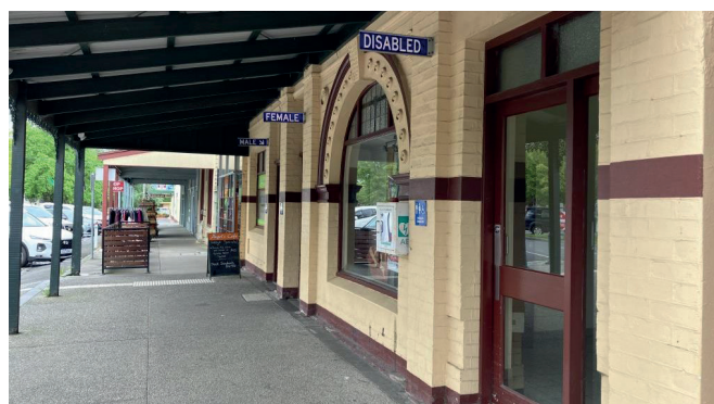
Work on the Havelock Street toilet block refurbishment is due to start next month.

This work is part of Council's building renewal program including public toilet blocks recently replaced at Amphitheatre, Waubra and Beggs St, Beaufort.