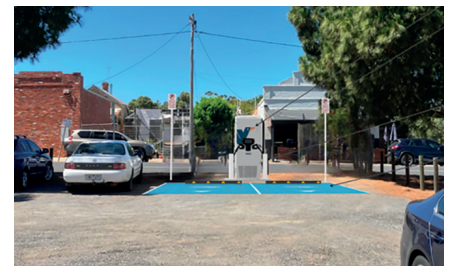
Artist's impression of the planned EV charging station in Avoca.

Council aims to have both charging stations installed and operating by the end of June 2023.