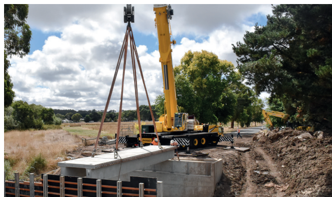
A crane lowers the deck into place on Bridge 139 on the Raglan-Elmhurst road.