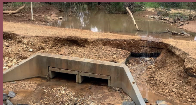
Susan's Lane in Percydale was among the roads severely damaged during the floods.

Updates on infrastructure repairs can be found on our website pyrenees.vic.gov.au/flood-updates and if you need help with any aspect of flood-recovery you can contact the Flood Recovery Team on 1300 797 363 or email recovery@pyrenees.vic.gov.au .