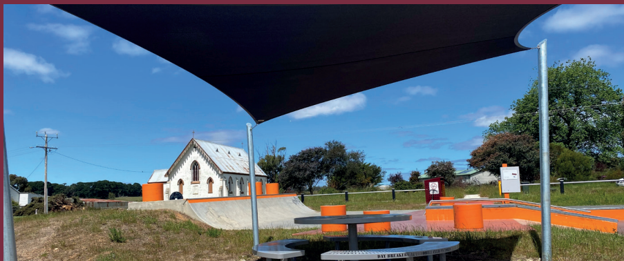
The new shade sail at the Snake Valley Skate Parks was funded in part by a Pyrenees Shire Community Grant.

Cr Eason credited the large number of grant applications to Council recognising the challenges created by the global pandemic and increasing the size of grants and changing the eligibility criteria to make it easier to apply. In addition, Council created a special Youth grant to support young people.