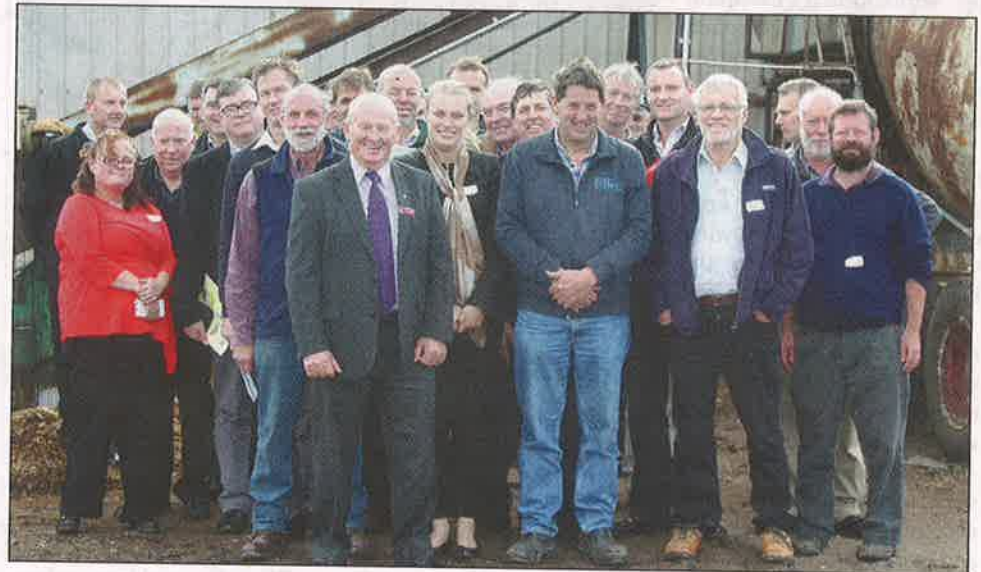
◆ Some of the participants at last week's forum inspect the wood chip facility at Pyrenees Timber.

Forum members also viewed the wood chip processing facility at nearby Chute.